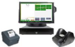
Quick Modules Cashier Workstation