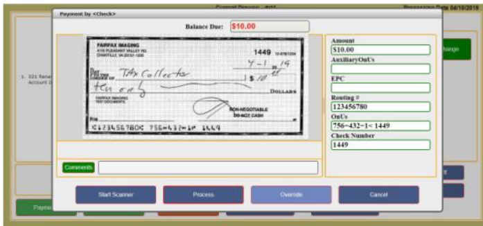
Scanning and OCR of Checks and Stubs